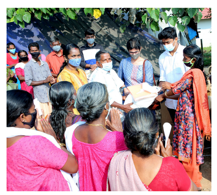
Habitat's Mundar Redevelopment Project helped nearly 200,000 families in the Mundar region recover with home repairs, community infrastructure, and opportunities for new and improved employment.

An additional 141 damaged homes have been repaired, and redevelopment of the village includes providing families access to solar energy through 286 household lighting