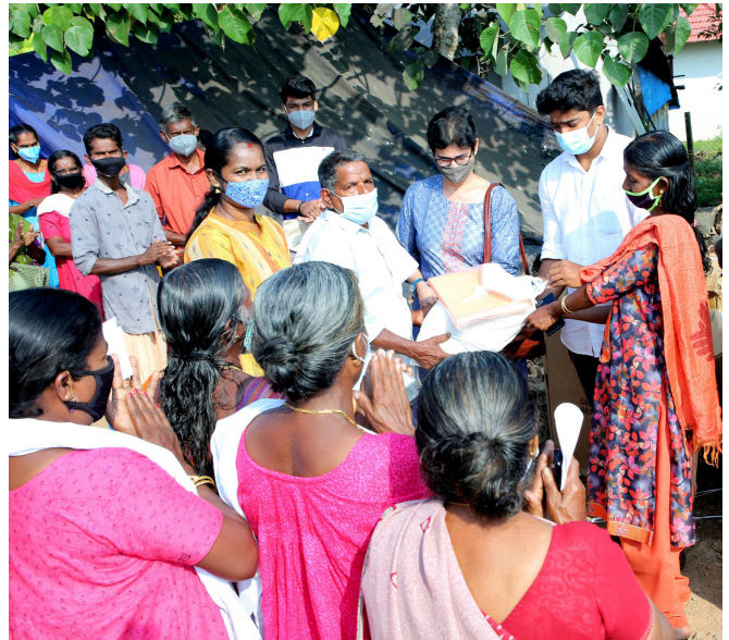
Habitat's Mundar Redevelopment Project helped nearly 200,000 families in the Mundar region recover with home repairs, community infrastructure, and opportunities for new and improved employment.

An additional 141 damaged homes have been repaired, and redevelopment of the village includes providing families access to solar energy through 286 household lighting